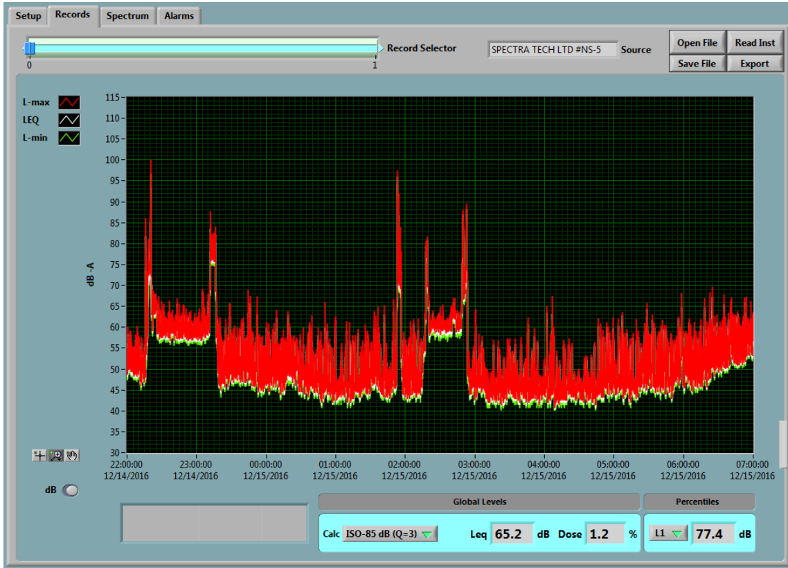
Example: dBA noise level plot