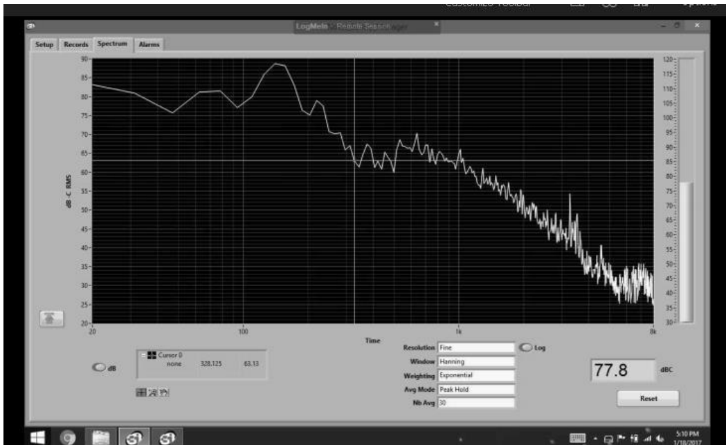
Example: dBC noise level & frequency plot